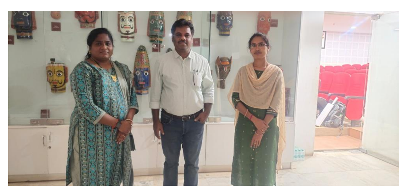
OUR FACULTY MEMBERS ATTENDED THE 5E PROGRAMME AT DSS BAVAN, MASABTANK HYADEARABAD