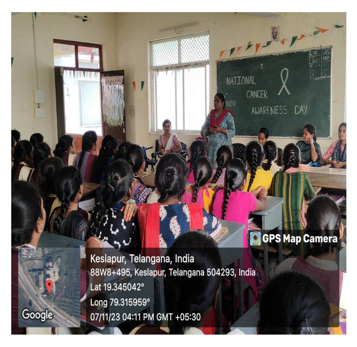
NATIONAL CANCER AWARENES DAY PROGRAM AT OUR INSTITUTION