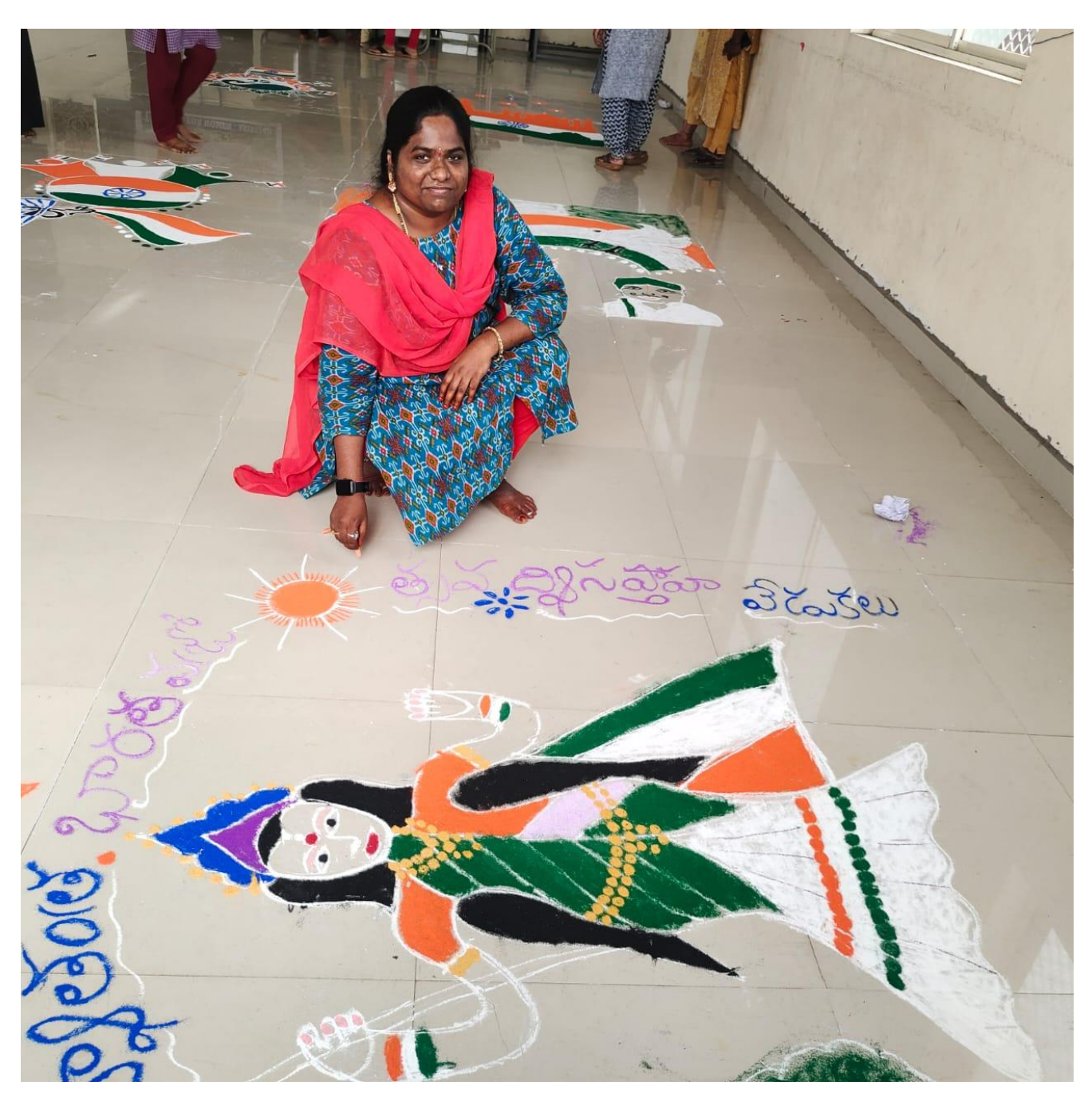
FACULTY PARTICIPATED IN INDEPENDENCE DAY CELEBRATIONS (VAJROTHSAV)